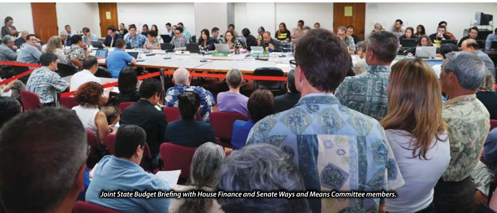
Joint State Budget Briefing with House Finance and Senate Ways and Means Committee members.

Additionally, lawmakers provided $1.15 billion in general obligation bonds and $2.5 billion for projects funded by all other means of financing for capital improvement projects that will play a vital role in rebuilding our economy and strengthening our social infrastructure.