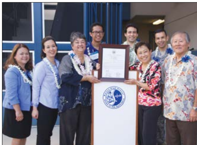
Earlier this year, Senator Tokuda attended the blessing of Kailua High School's newly constructed Natural Science Lab Building.

HB1907 HD2 SD2 CD1: Requires all law enforcement agencies and departments charged with maintenance, storage, and preservation of sexual assault evidence collection kits to conduct an inventory of all stored kits and report to the Attorney General. Requires the Department of